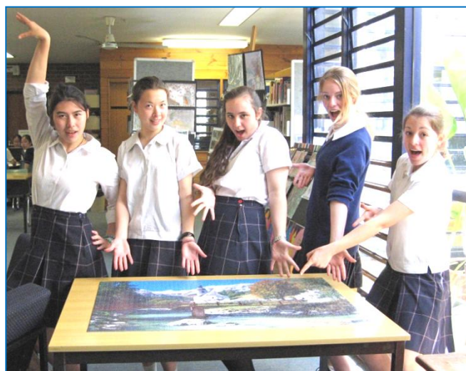
Biggest Jigsaw Ever Completed

service provided by the State Library. A local library card is a must as well. Local libraries have been allocated funds to provide access to certain databases from home such as the Australian New Zealand Reference Centre.